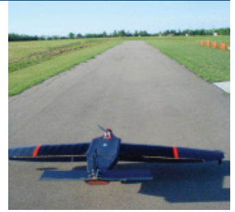
(above and below) "Lion in the Sky" 2006 Team

We are a young club looking to expand, and this is a learning process for everyone involved. If you're curious about getting involved as a member, sponsor, or a technical advisor, please e-mail one of us or show up for one of our meetings which are held every Tuesday at 8:30 PM, during the academic year, in 833 Mudd. Many of our competitors boast of faculty advisors, and we are looking for a professor or technical professional here to step up to the challenge for Columbia University AIAA. If you have any questions, feel free to reach someone on the board. All are welcome and no prior experience is necessary. All we require is a passion for aircrafts and aeronautics - we'll teach you all you need to know.