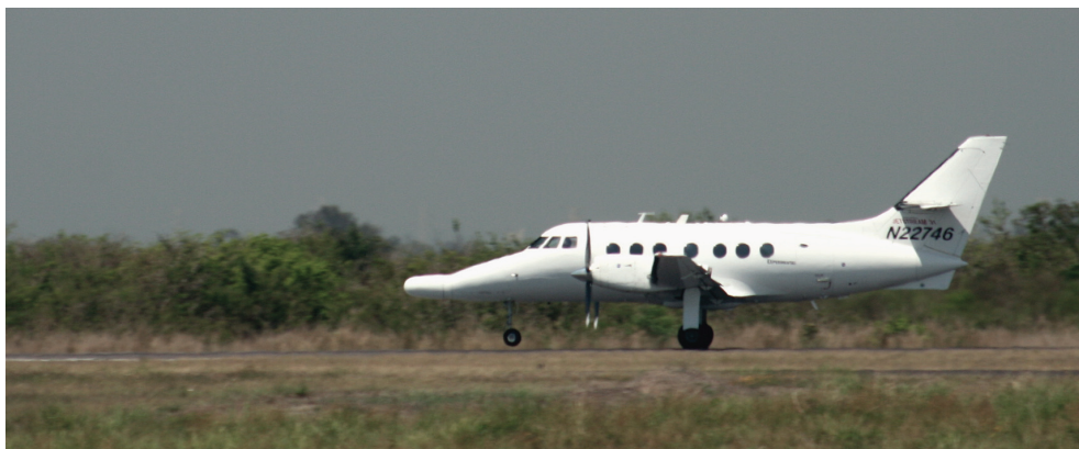
Lift-off of the Jetstream-31 aircraft during a research flight in Veracruz, Mexico. The Research Scanning Polarimeter is located in the tail of the aircraft.

As part of this model development effort, I have had the opportunity to participate in several field campaigns with an airborne APS prototype, called the Research Scan-