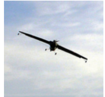
(below) "A Hard Day's Flight" 2007 Team