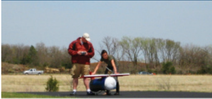
"The CU AirLion" 2008 Team