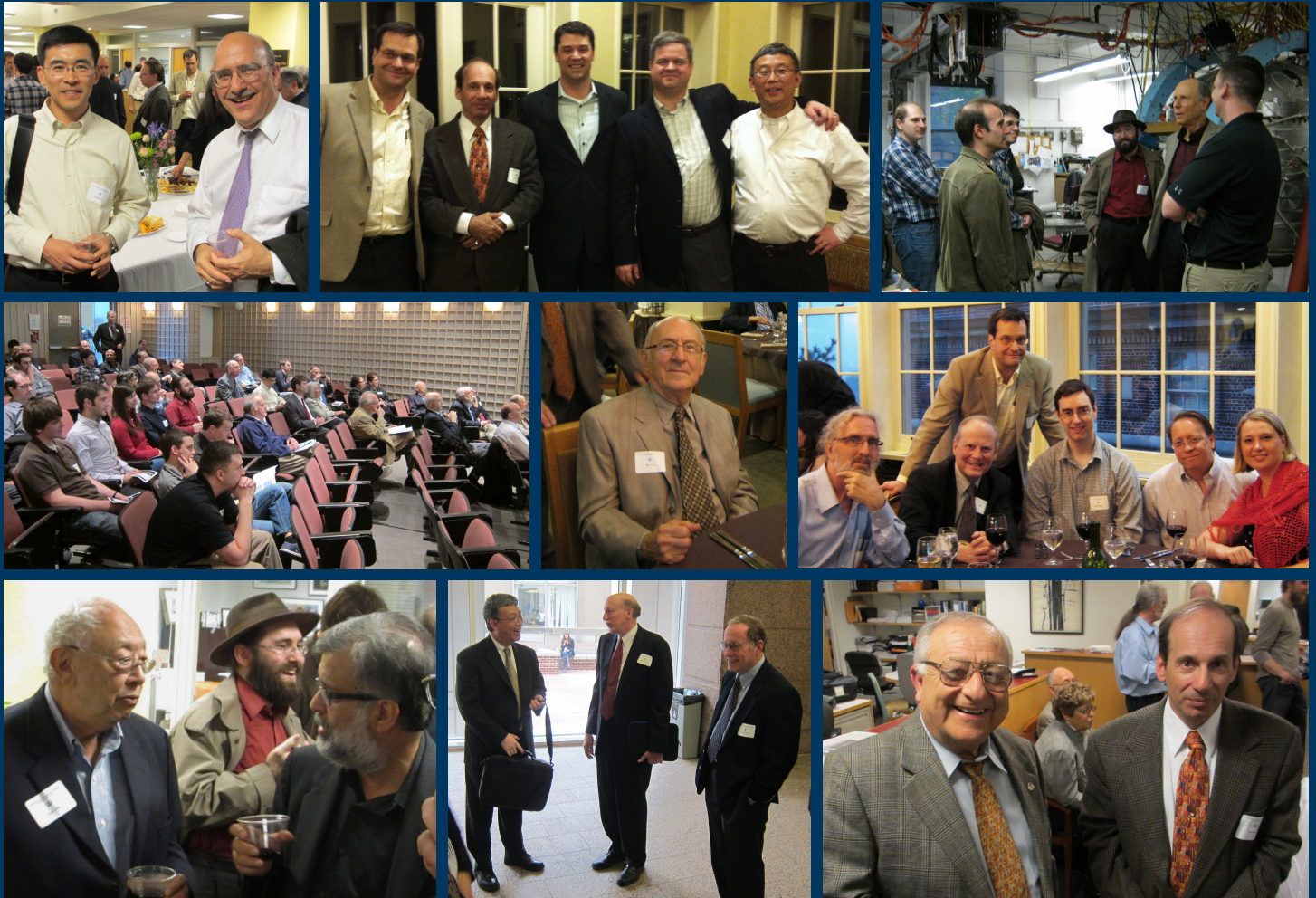
Photos from the Plasma Physics Laboratory 50 th Anniversary Celebration on April 26, 2012